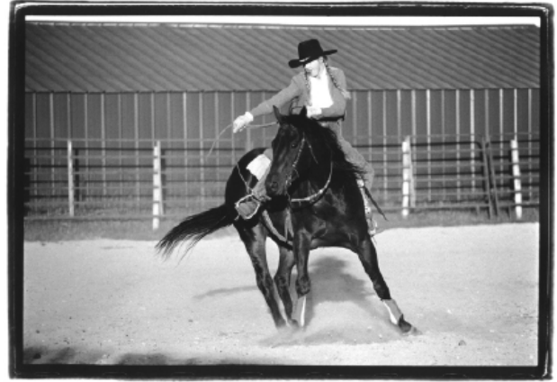
"Tara working out with one of her cutting horses." By Ronnie Farley, ca. 1993, 16" x 20," courtesy the artist. See this photograph and more during "Cowgirls: Contemporary Portraits of the American West," Oct. 21-Nov. 30 at the Central Library.