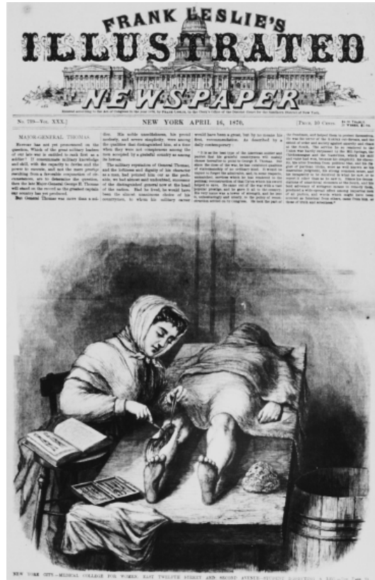
Above: An illustration of anatomical lectures at the Women's Medical College of the New York Infirmary, Frank Leslie's Illustrated Newspaper, April 16, 1870. The Women's Medical College was founded by Dr. Elizabeth Blackwell and her sister, Emily Blackwell, in 1869. Left: S. Josephine Baker, M.D., Dr. P.H., was a prominent public health physician during the first half of the 20th century.

The exhibition's visit to Wichita and related programming has been assisted by the Medical Society of Sedgwick County, Via Christi Health, KU School of Medicine-Wichita, the Wichita Public Library Foundation, the National Endowment for the Humanities and the City of Wichita. Look for related exhibits at The Kansas African American Museum and Wichita-Sedgwick County Historical Museum.