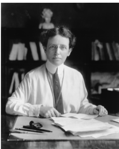
Left: S. Josephine Baker, M.D., Dr. P.H., was a prominent public health physician during the first half of the 20th century. ca. 1920.